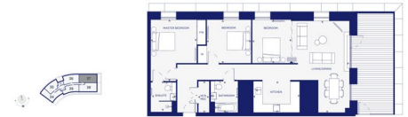
MacDonald House 1074 sqft

Legend FWD - Fitted Wardrobe W/O - Washbasin W/C - Heating, Electrical Components W - Provisional Space for wardrobe